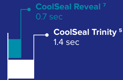
Average seal time per device

CoolSeal devices produce consistently strong, secure seals in under 2 seconds