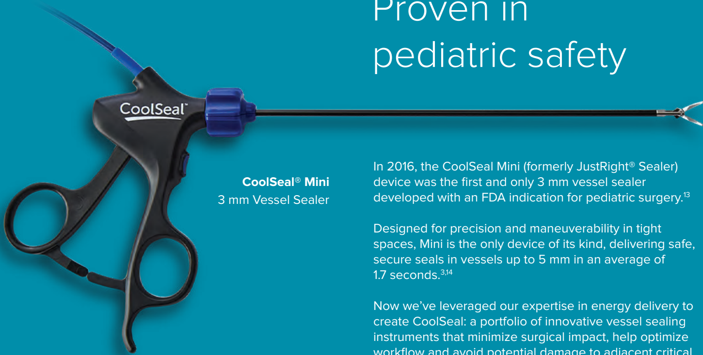
CoolSeal ® Mini 3 mm Vessel Sealer

In 2016, the CoolSeal Mini (formerly JustRight ® Sealer) device was the first and only 3 mm vessel sealer developed with an FDA indication for pediatric surgery. 13